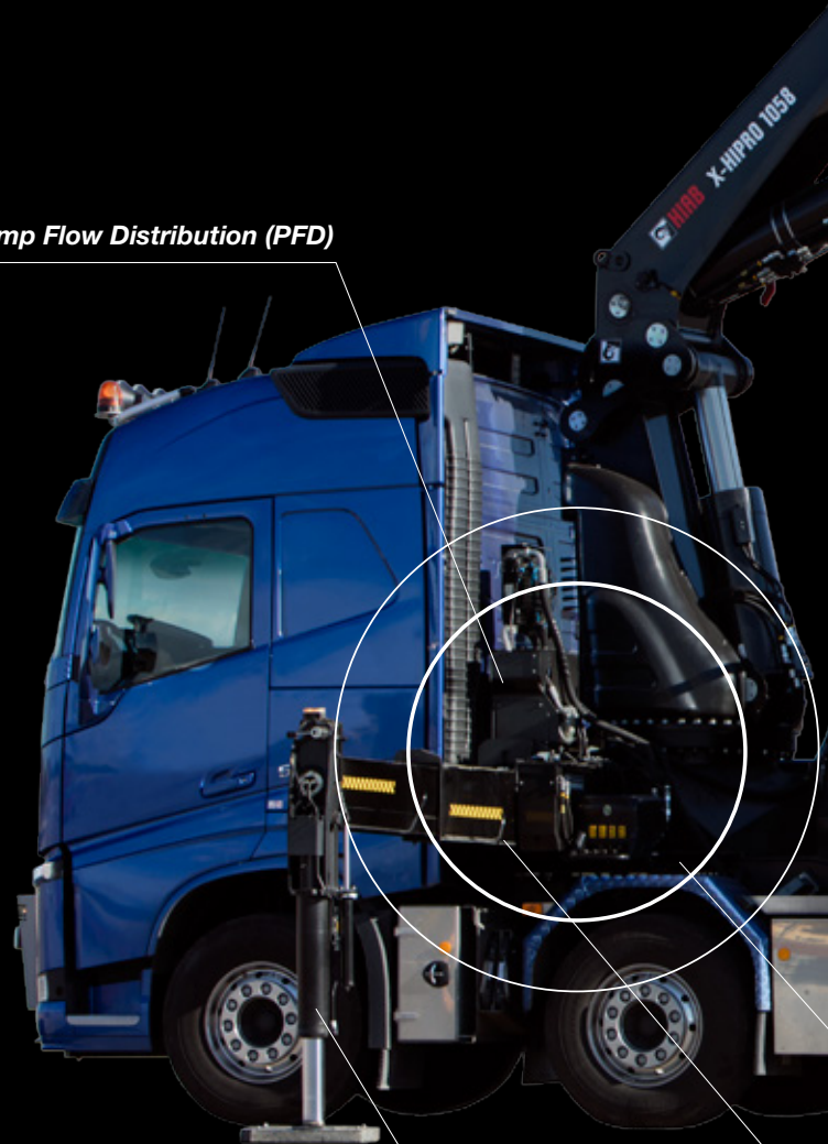
Easy tilting of stabiliser legs